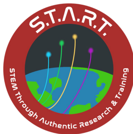
Figure 2. START Mission Patch Logo. In the theme of space missions, the START Program has designed a logo that is printed on stickers, patches, and face masks to provide to students, teachers, and community partners to build a sense of belonging in the program. Future logos will be designed by START Apprentices to further build ownership in the program.